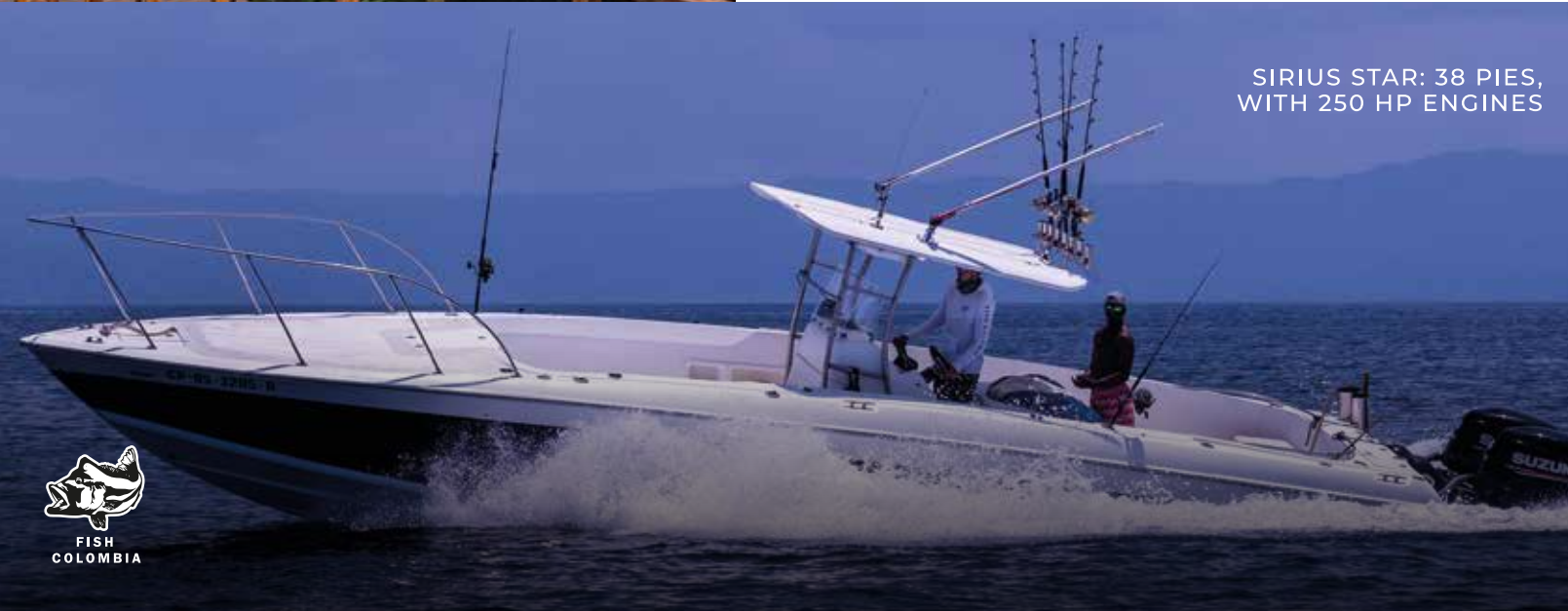
SIRIUS STAR: 38 PIES, WITH 250 HP ENGINES