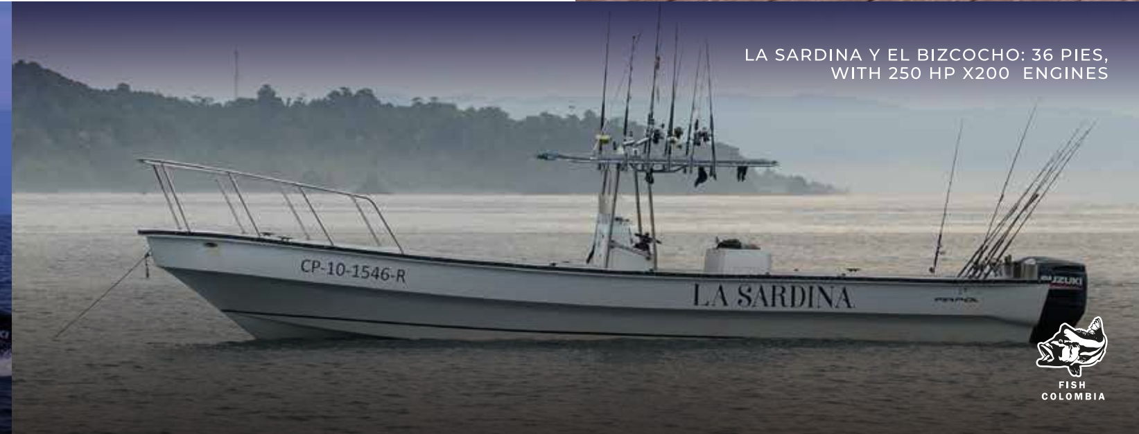
LA SARDINA Y EL BIZCOCHO: 36 PIES, WITH 250 HP X200 ENGINES